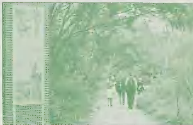
Visitors are immersed in an outstanding bushland experience at Melbourne Zoo.

'Getting the message across' was all about communication. Communication with regard to indigenous perspectives, environmental education, animal husbandry, marketing, collections management, veterinary science, and zoological horticulture/botany.